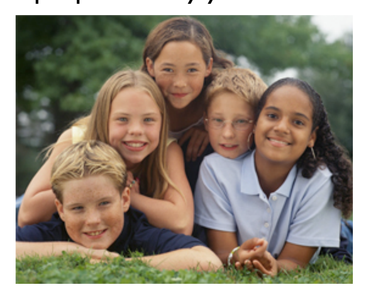
If you are friendly to others , chances are that they will be friendly to you too.

So, remember the golden rule: Treat other people the way you want to be treated.